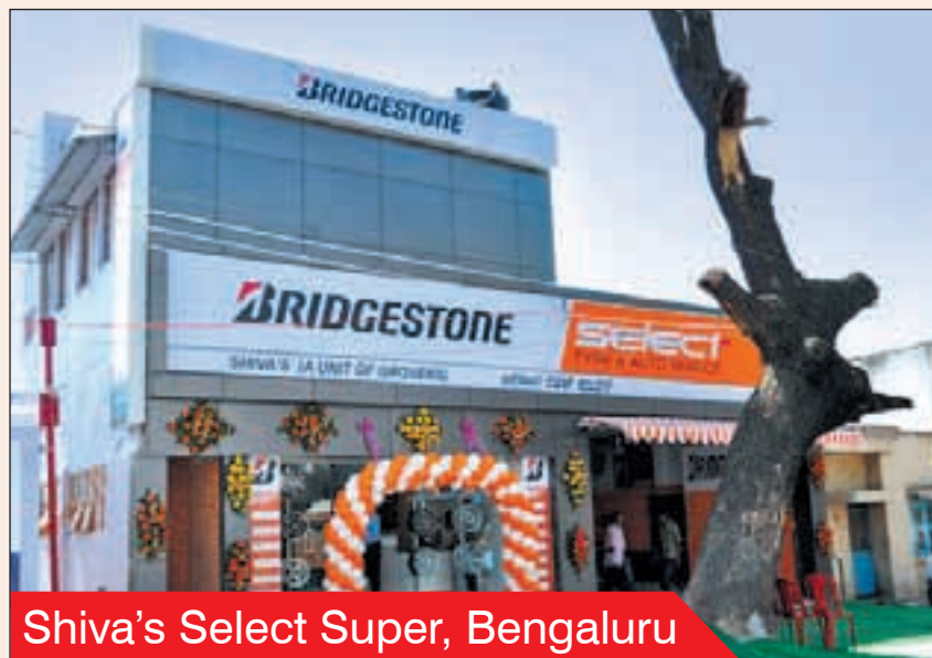
Shiva's Select Super, Bengaluru