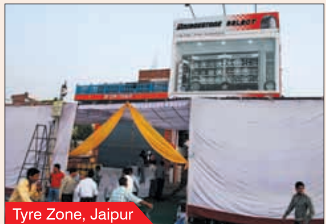
Tyre Zone, Jaipur