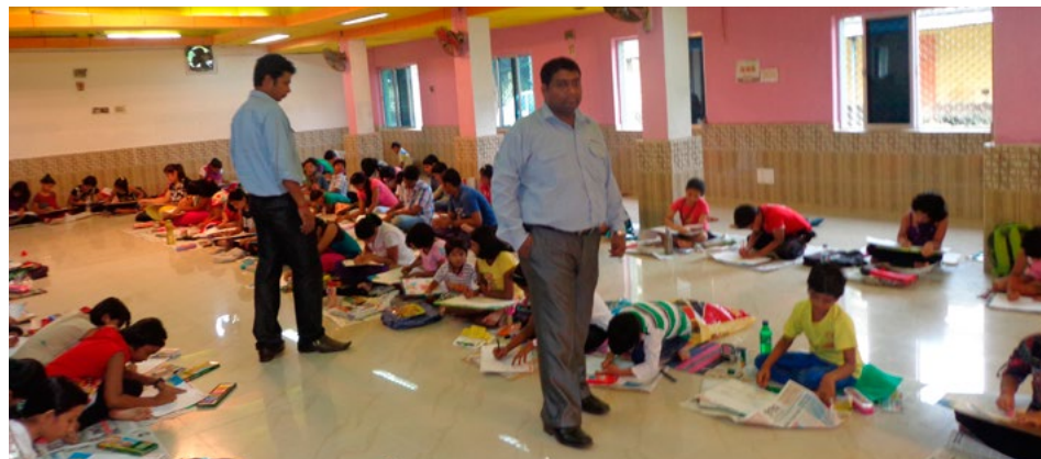
Diamond Enterprises, Bhubaneswar

We continued with our CSR Activity 'Environment & You', a drawing competition for kids at our Bridgestone Select Super Concept Stores. The children were given drawing materials and a theme of 'Environment & You', to express their understanding and perception of the environment today. The Drawing Competition carried the message of protecting the environment from the kids to their parents. The activity was carried out at: