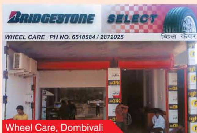
Wheel Care, Dombivali