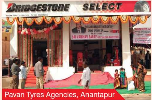
Pavan Tyres Agencies, Anantapur