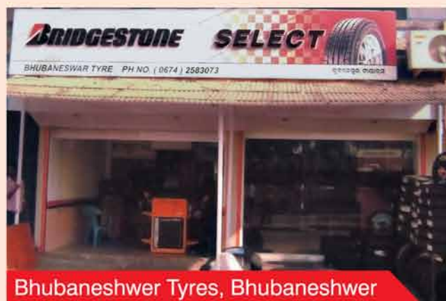
Bhubaneshwer Tyres, Bhubaneshwer