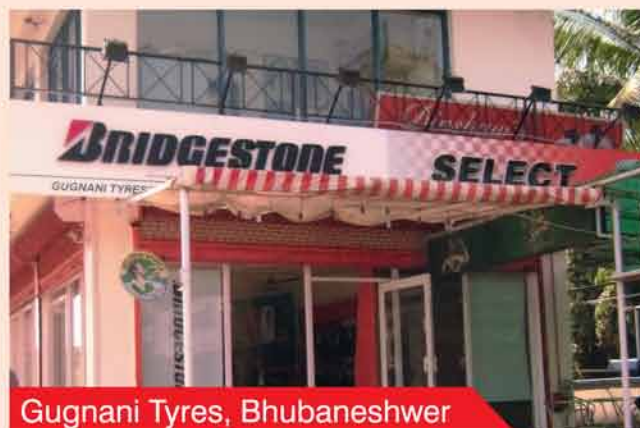
Gugnani Tyres, Bhubaneshwer