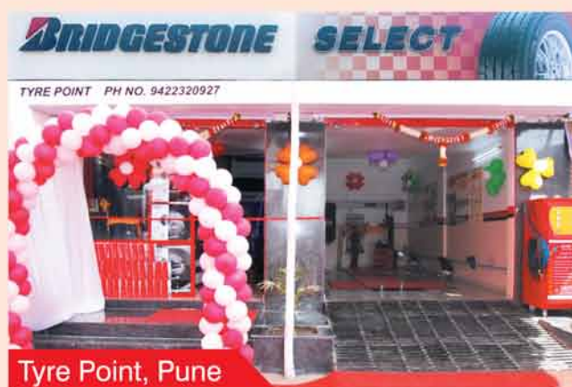
Tyre Point, Pune