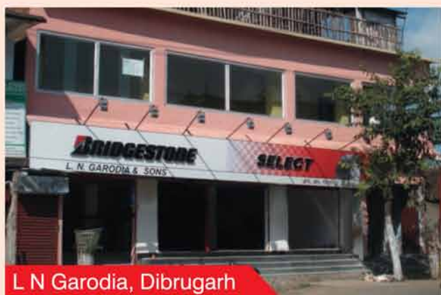
L N Garodia, Dibrugarh