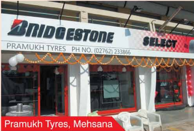
Pramukh Tyres, Mehsana